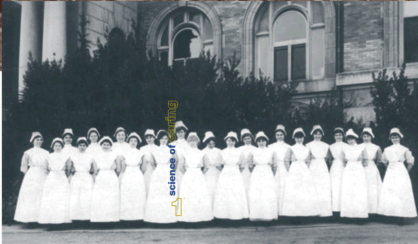
The University of California Hospital Training School's first class of nursing students.

Nursing was almost the only way for women to be directly involved in the war effort.